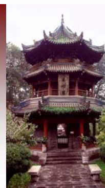
Xian Mosque, China

“When My servants ask thee concerning Me, I am indeed close (to them): I listen to the prayer of every suppliant when he calleth on Me: Let them also, with a will, Listen to My call, and believe in Me: That they may walk in the right way.” Qur'an 2:186